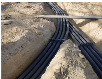
KISR Warehouses Electrical Cable ducts