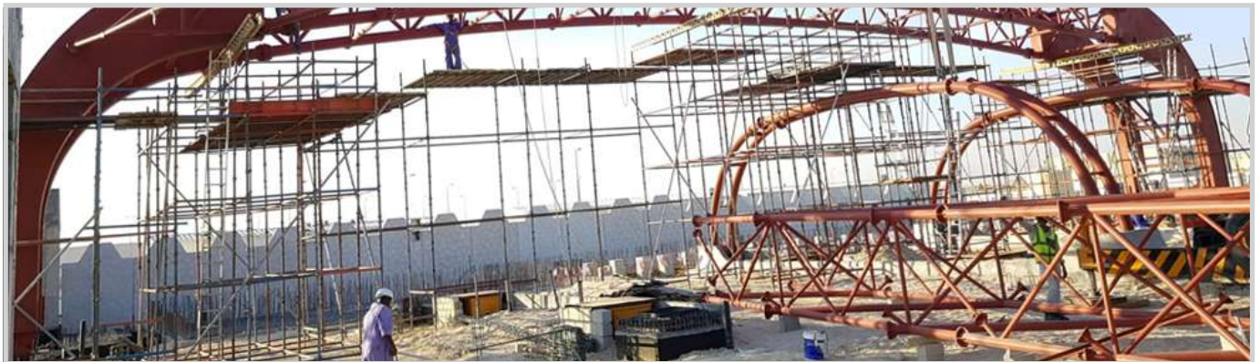
KISR warehouse project

MEP Works :- Supply and installation of Copper pipes,AC Gas and electrical works for CRAC Units for DATA Centre.