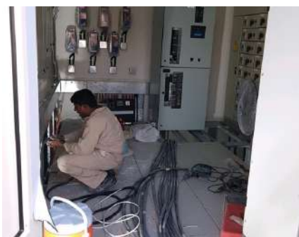
Knpc Fuel project