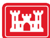
US Army Corps of Engineers