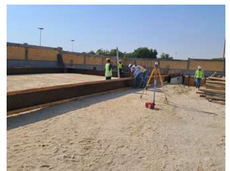
Subvhan Warehouse project Water Tank Base